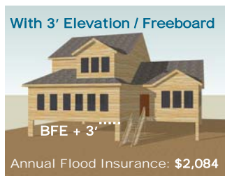
Example of an elevated home and the possible insurance savings

these steps can lower one's flood insurance premiums and result in long-term savings (see fact sheet 5 on the StormSmart Coasts webpage):