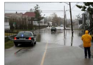
Emergency Personnel helping with an evacuation during the Patriot's Day Storm

How to information is available through MEMA's website ( mass.gov/mema ) under the "Hot Topics" section. It addresses many subject areas, including: