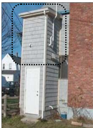
Addition, partially funded by FEMA, constructed to elevate utilities

There are several proactive measures a homeowner can take to prevent losses from storm events. Plus,